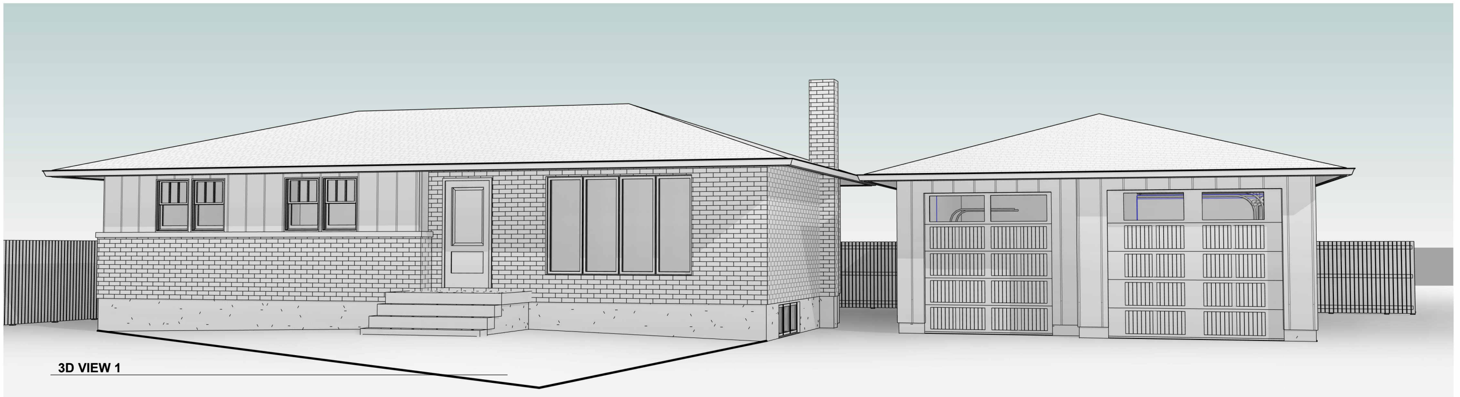
3D VIEW 1